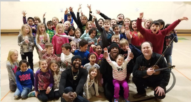
Urban Dance Workshop